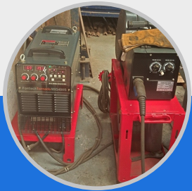
ADOR FONTECH MIG Welding Machine – 400 KVA