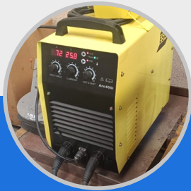
ESAB – ARC Welding M/c – 400I – 3 Phase