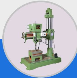
Radial Drilling and Tapping Machine