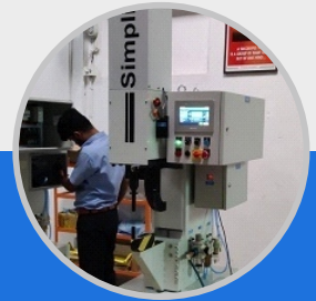
CLINCHING Machine Numatica Technologies