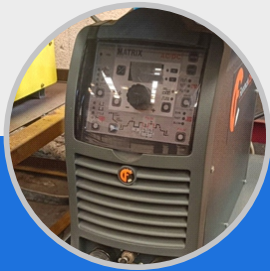
AC/DC PULSE TIG Welding Machine AUDOR FONTECH – 300KVA